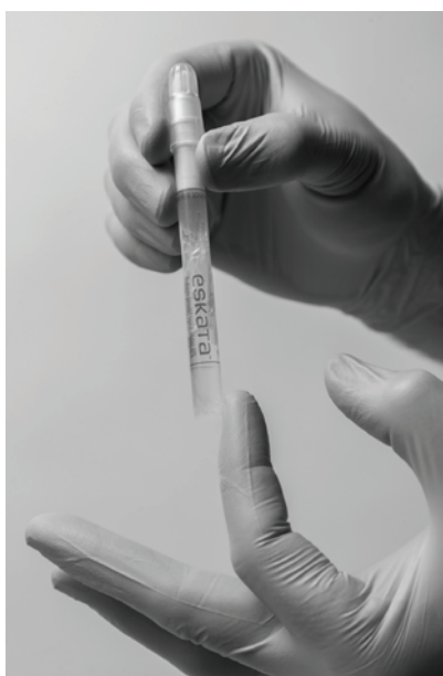
Step 4: Holding the applicator with cap pointing up, tap the bottom of the applicator to separate the solution from the crushed ampule.