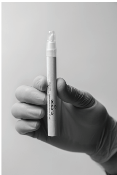
Step 1: Hold the ESKATA applicator so that the applicator cap is pointing up