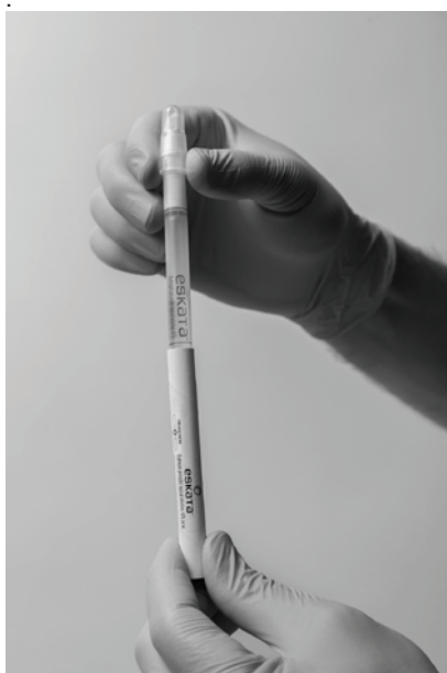
Step 3: Remove the sleeve.